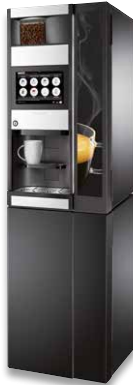
The elegant base stand enhances the design of the machine.