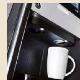
A light path in the cup area helps ensure that the cup is placed in the correct position. Cup sensors recognize cups or mugs made from a variety of different material including paper, plastic, glass and porcelain.