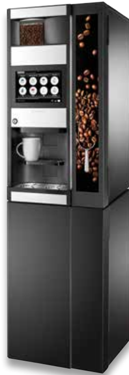
The elegant base stand enhances the design of the machine.

Evoca S.p.A. reserves the right to alter specifications without prior notice L026X1