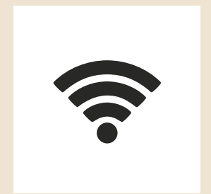
WiFi and Bluetooth enabled on-screen information and entertainment.