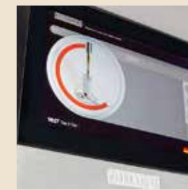
The user-friendly interface lets you prepare a drink just the way you like it, allowing you to make changes to the strength and amount of ingredients - you can even save your personalized drink in the layout.