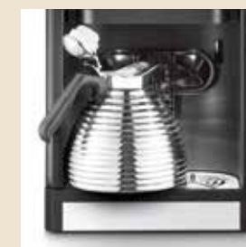
The spacious delivery area with adjustable cup holders allows you to fill coffee pots or thermo jugs.