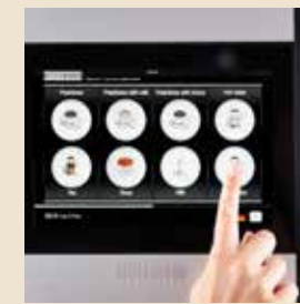
The 10" touch screen - 1280 x 800 - offers a visual guide, making choices easy. The design and layout of the screen can also be fully customized to suit any environment.