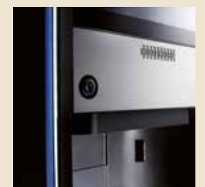
LED lights frame the cup area which enhance the overall visual appearance and user experience.