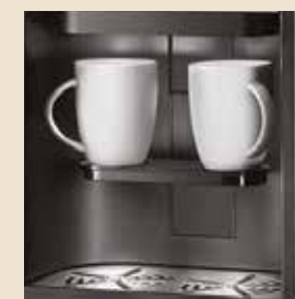
Separate delivery points: Coffee, chocolate, and mixed drinks on the left, and water on the right. This prevents any cross contamination into the water.